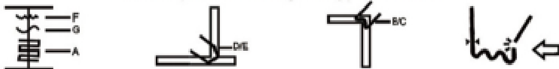
Fracture plastic welding nail type selection